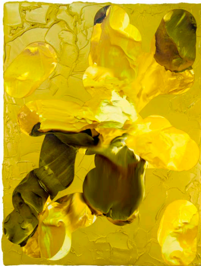
André Hemer, Big Node #31 , 2016, acrylic and pigment on canvas, 120 x 90cm.