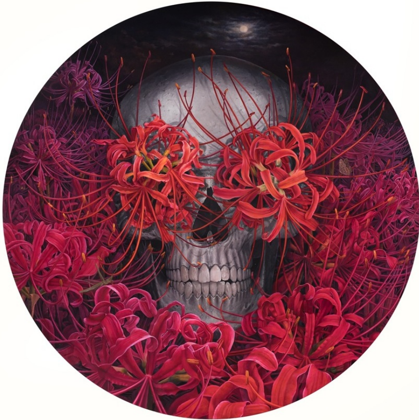
Navin Rawanchaikul, The Other Side of the Moon , 2016, oil on canvas, 190cm diameter.