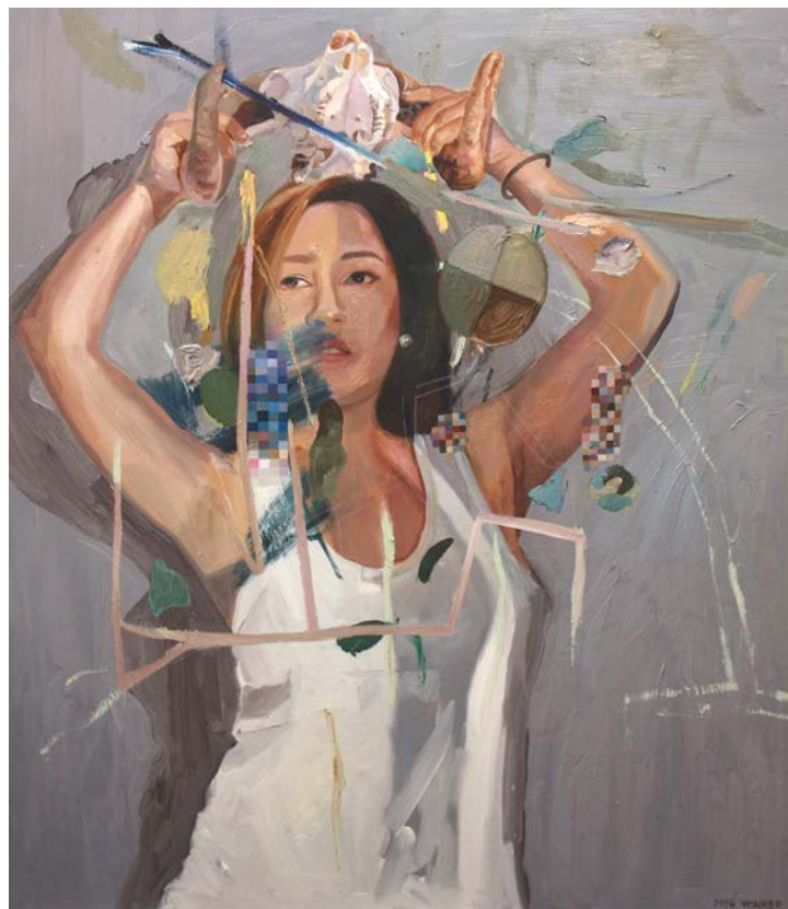
Winner Jumalon, Encuentro , 2016, oil on canvas, 122 x 107cm.