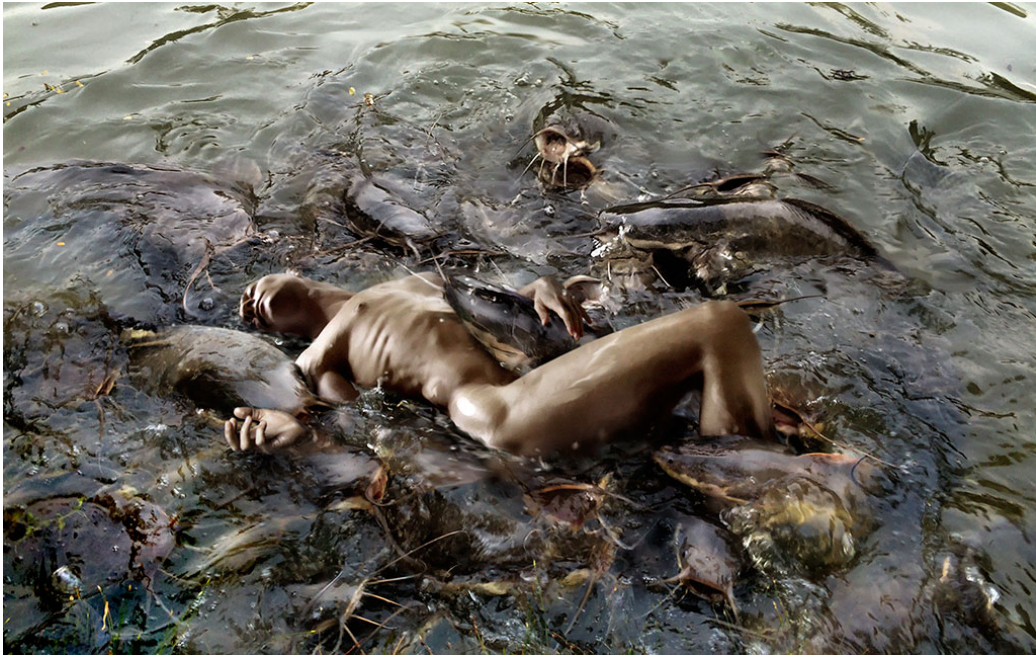
Ahmad Zakii Anwar, Tales from the Primordial Garden I , 2015, ultrachrome HDR pigment ink on Canson Edition Etching 310gsm Fine Art Paper, 92 x 140cm.